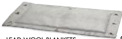
LEAD WOOL BLANKETS