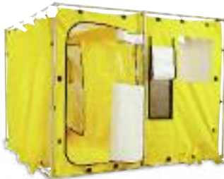
DUAL CHAMBER TENT