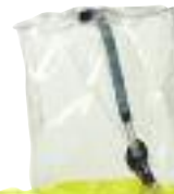
AIR FED HOOD