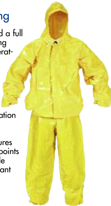
TWO PIECE SUIT