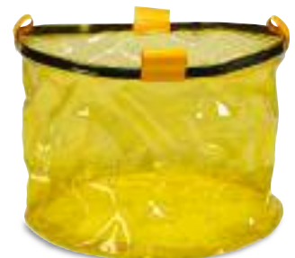
FLAT BOTTOM CYLINDRICAL CATCH CONTAINMENT

For use under components to capture drips or leaks, Catch Containments, Drip Bags and Drip Pockets can help prevent the potential spread of contamination. Lancs manufactures two basic styles, cylindrical and conical, in yellow for radiological use, or clear with green rim and tabs for non-radiological use.